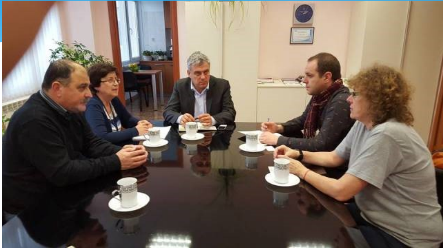
Meeting with the State enterprise Radioactive waste management